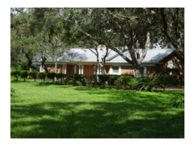
AN INVITATION FROM THE MISSION AND OUTREACH COMMITTEE

We look forward to this being a beautiful and worshipful Advent Season at First Presbyterian Church of Victoria, Texas.