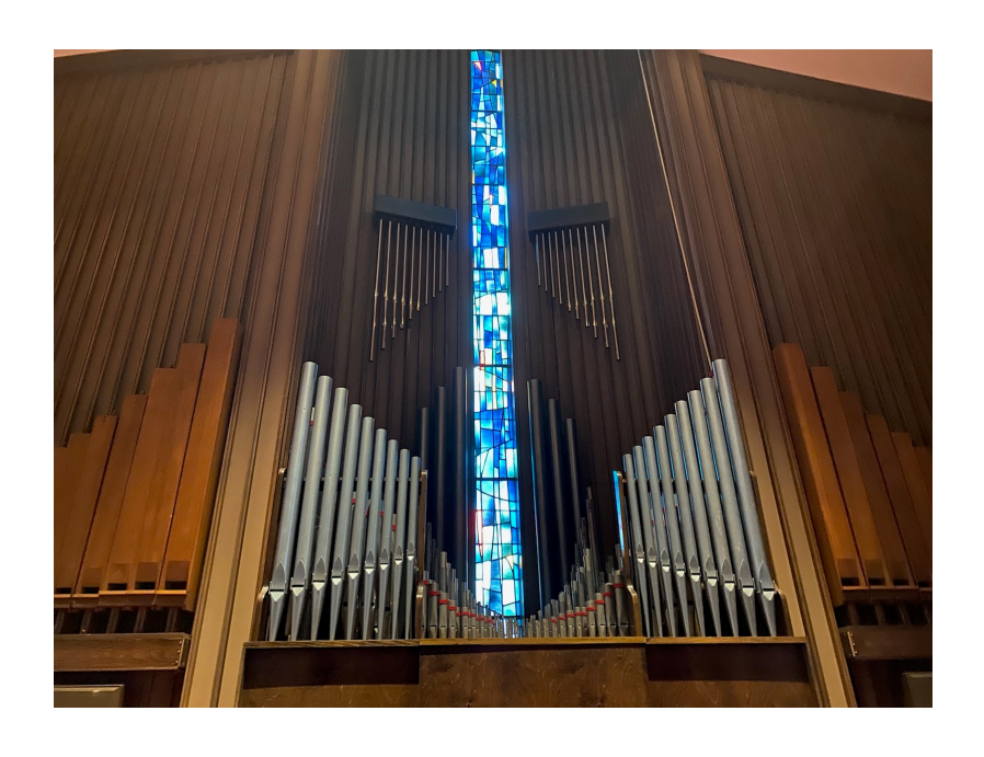
WORSHIP SERVICE ON SUNDAY, JANUARY 24, 2021

Our Scripture readings for next Sunday, January 24, 2021, the Third Sunday after the Epiphany, are: Psalm 62:5-12; and Mark 1:14-20. The sermon title is "Christ's Transforming Call," and the Bulletin is available here: <a href="https://fpcofvictoria.org/wp-content/uploads/2021/01/2021-1-24-Bulletin1-PDF.pub">https://fpcofvictoria.org/wp-content/uploads/2021/01/2021-1-24-Bulletin1-PDF.pub</a>.pdf