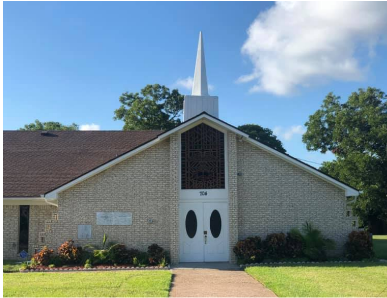
Mt. Nebo Missionary Baptist Church, Victoria, Texas

showcase an organ anthem, "I'll Walk with God." Please join us in person or on our Facebook page or website for another beautiful morning of music!