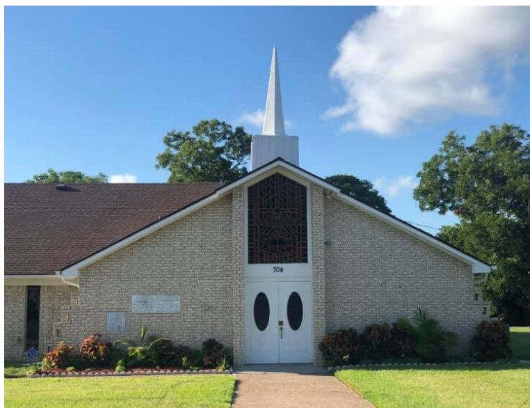
Mt. Nebo Missionary Baptist Church, Victoria, Texas