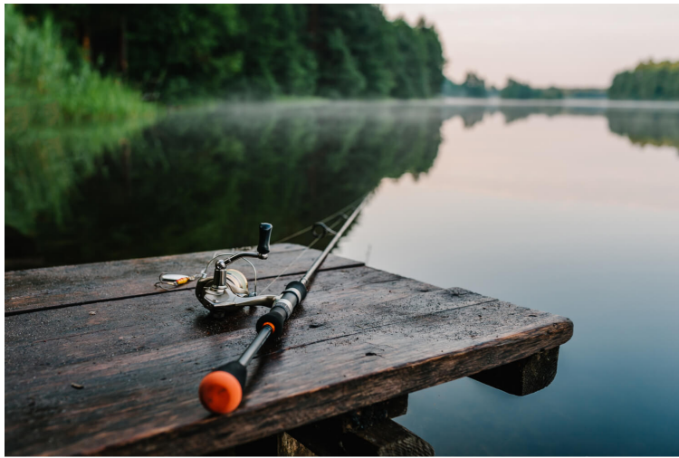
Gone fishing . . .

I am forever grateful to this congregation for the time they afford me to step away from my pastoral duties at FPC in order to spend time with my family, to rest, and to relax. During this time, I am refreshed and given the opportunity to re-create myself in order to better serve you and to go about God's work in his kingdom.