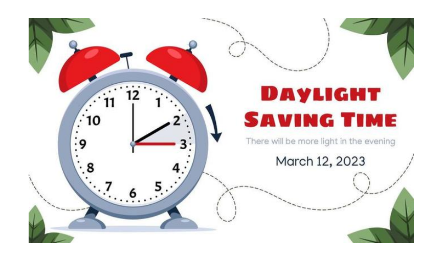
GET ME TO THE CHURCH ON TIME!

Please don't forget to set your clocks FORWARD on Saturday night before next Sunday's worship service as most of the country switches to Daylight Saving Time. If you forget, you will arrive at church at 11:30 a.m., Standard Time, instead of 10:30 a.m. DST.