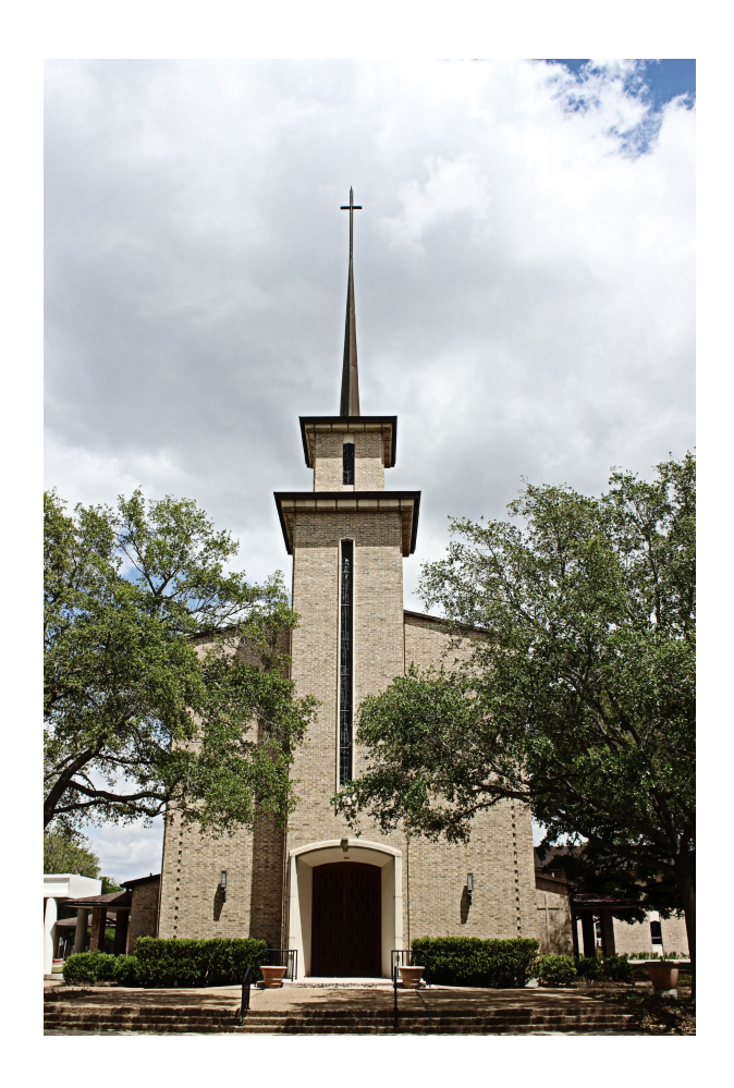
PLEASE JOIN US FOR WORSHIP ON SUNDAY, JULY 16, 2023, AT 10:30

As we all struggle against the lethargy-inducing heat of July in Victoria, please join us in the air-conditioned comfort of our Sanctuary for worship this Sunday, the Seventh Sunday after Pentecost, July 16, 2023, at 10:30 a.m. We