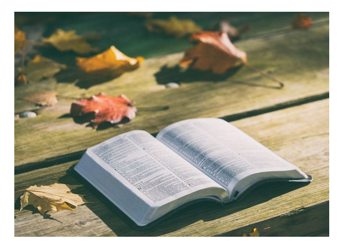
Submitted by Dawn Neel