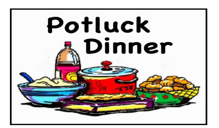
Submitted by Becky Richter