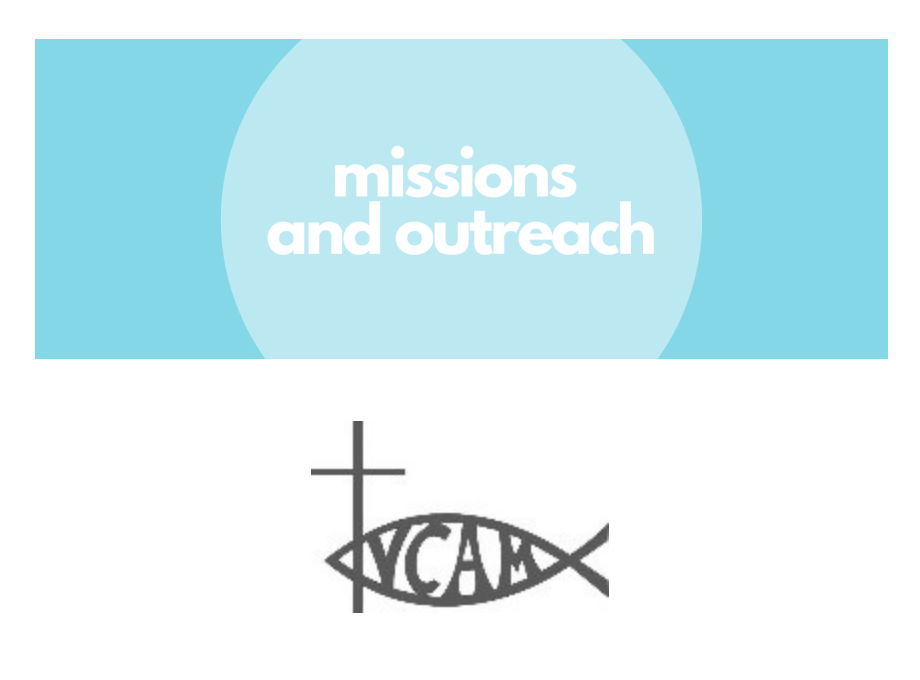
November Brown Bag Scavenger Hunt

Please bring your favorite meat, side dish or dessert and we will enjoy a delicious pot luck meal after the worship service. Afterwards, there will be a brief overview of the 226th General Assembly of the Presbyterian Church, U.S.A., which was held in Salt Lake City, Utah, June 2024. Our friends from Grace Presbyterian Church have also been invited to join us for this delicious meal and informative fellowship event. Hope to see you there!