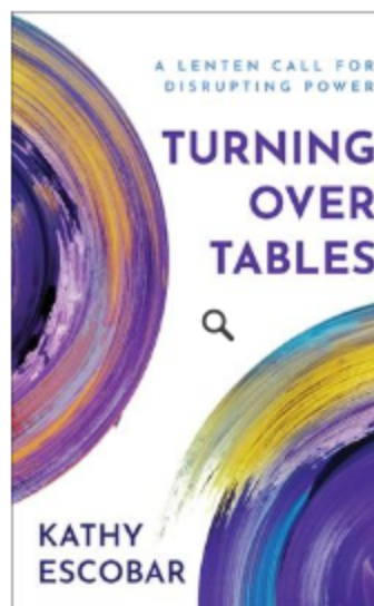
Lenten Study Book